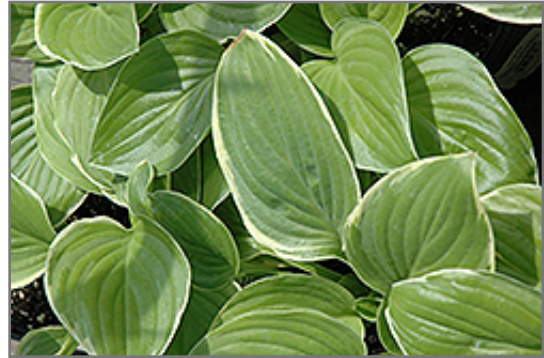
Frozen Margarita Hosta foliage

Frozen Margarita Hosta is recommended for the following landscape applications;