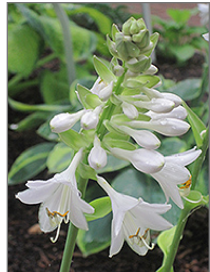
King Tut Hosta flowers