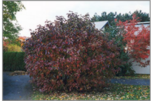
Siberian Dogwood in fall

This shrub does best in full sun to partial shade. It is an amazingly adaptable plant, tolerating both dry conditions and even some standing water. It is not particular as to soil type or pH. It is highly tolerant of urban pollution and will even thrive in inner city environments. This is a selected variety of a species not originally from North America.