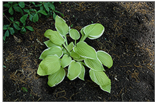
St. Elmo's Fire Hosta