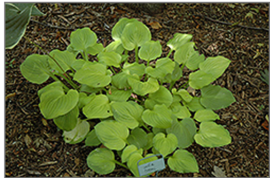
Vanilla Cream Hosta