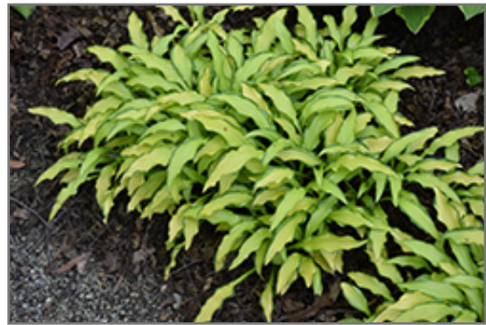
Kabitan Hosta