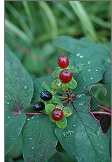
Albury Purple St. John's Wort fruit

* This is a 'special order' plant - contact store for details