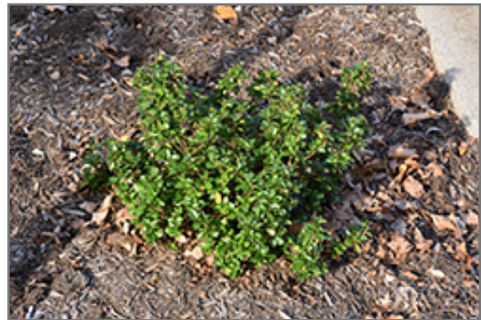
Emerald Magic Meserve Holly