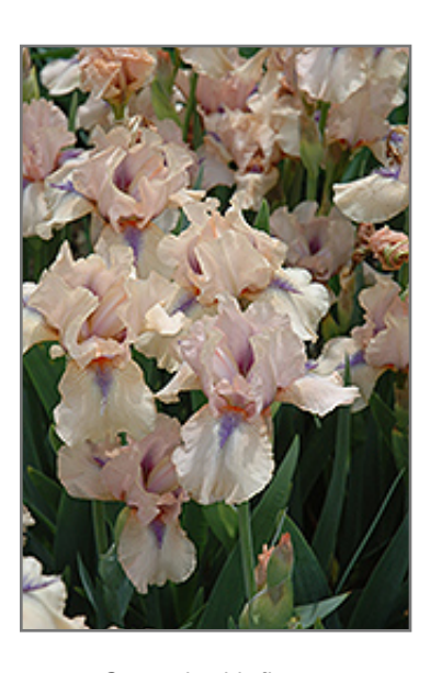
Concertina Iris flowers