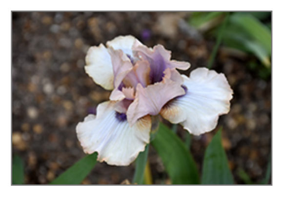
Concertina Iris flowers