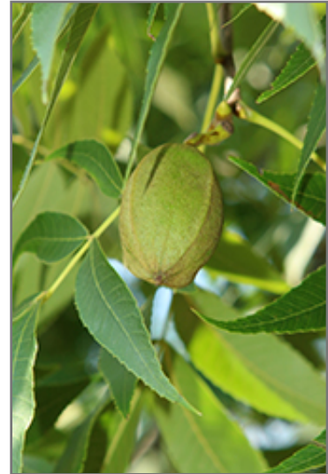
Pecan fruit

This is a deciduous tree with a shapely oval form. Its average texture blends into the landscape, but can be balanced by one or two finer or coarser trees or shrubs for an effective composition. This is a high maintenance plant that will require regular care and upkeep, and is best pruned in late winter once the threat of extreme cold has passed. It is a good choice for attracting squirrels to your yard. Gardeners should be aware of the following characteristic(s) that may warrant special consideration;