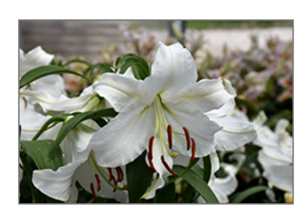
Casa Blanca Lily flowers

A striking hybrid lily producing large downward-facing white blooms, crowning sturdy straight stems that are excellent for cutting; this variety is a good choice to create focal interest in areas around shrubbery or border plantings