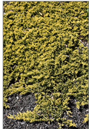
Mother Lode Juniper foliage