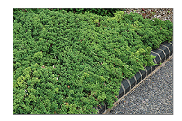
Green Mound Dwarf Japanese Juniper

This is a relatively low maintenance shrub, and is best pruned in late winter once the threat of extreme cold has passed. Deer don't particularly care for this plant and will usually leave it alone in favor of tastier treats. It has no significant negative characteristics.