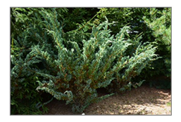
Meyer Juniper