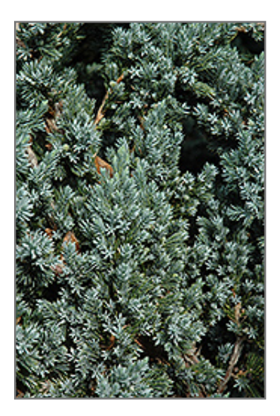
Meyer Juniper foliage