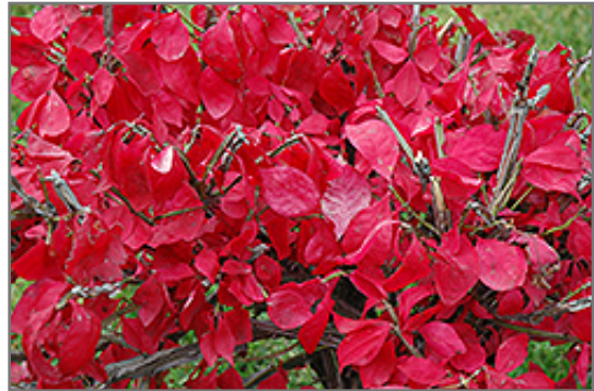
Compact Winged Burning Bush in fall