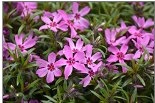
Crimson Beauty Moss Phlox flowers