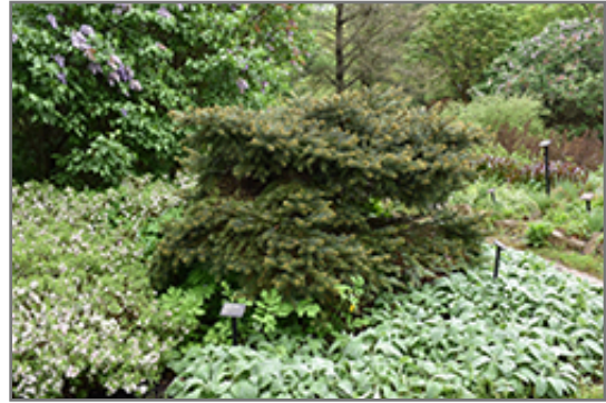
Blue Mesa Blue Spruce

Blue Mesa Blue Spruce is recommended for the following landscape applications;