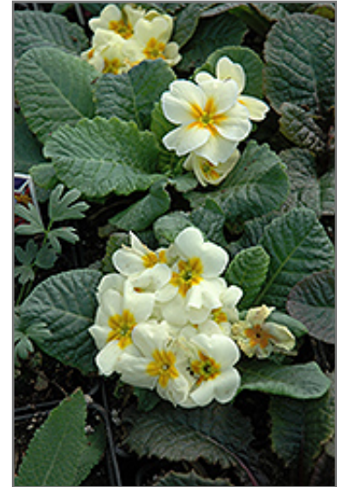
Wanda Primrose flowers

Wanda Primrose is recommended for the following landscape applications;