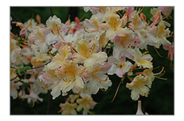
Clarice Azalea flowers

361 N. Hunter Highway Drums, PA 18222 (570) 788-4181 www.beechwood-gardens.com