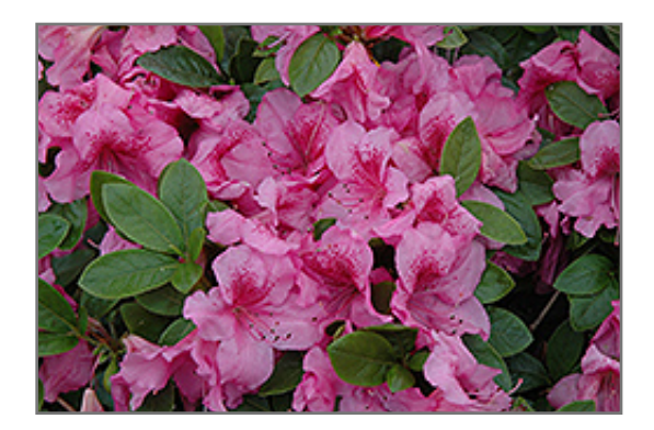
Hoosier Rose Azalea flowers

361 N. Hunter Highway Drums, PA 18222 (570) 788-4181 www.beechwood-gardens.com