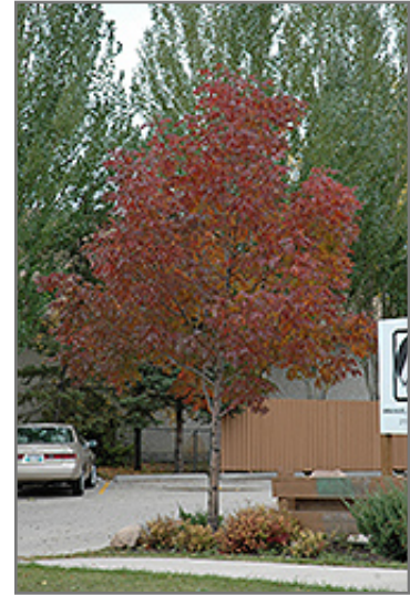
Northern Blaze White Ash in fall