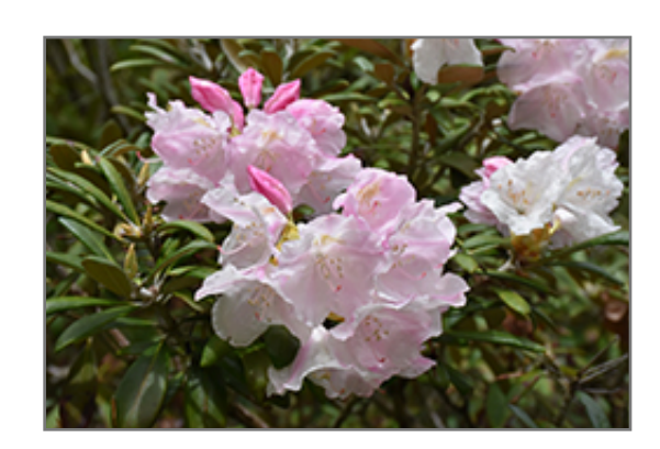
Mist Maiden Rhododendron flowers

Mist Maiden Rhododendron is covered in stunning clusters of lightly-scented white trumpet-shaped flowers with shell pink overtones and light green spots at the ends of the branches in mid spring. It has green foliage with tan undersides. The narrow leaves remain green throughout the winter.