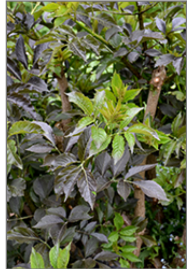
Thundercloud Elder foliage

* This is a 'special order' plant - contact store for details