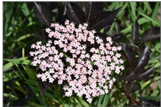
Thundercloud Elder flowers