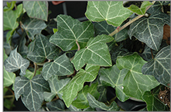
Baltic Ivy foliage