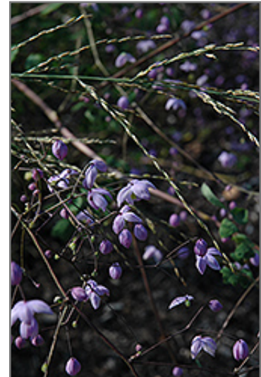
Splendide Meadow Rue flowers