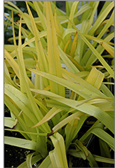
Sunshine Charm Spiderwort foliage

Sunshine Charm Spiderwort is recommended for the following landscape applications;