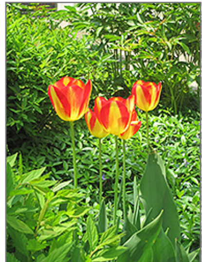
Antoinette Tulip in bloom