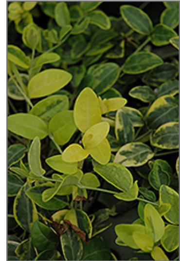
Sunny Skies Periwinkle flowers

Sunny Skies Periwinkle is recommended for the following landscape applications;