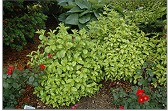
Ghost Weigela

This shrub should only be grown in full sunlight. It prefers to grow in average to moist conditions, and shouldn't be allowed to dry out. It is not particular as to soil type or pH. It is highly tolerant of urban pollution and will even thrive in inner city environments. This is a selected variety of a species not originally from North America.