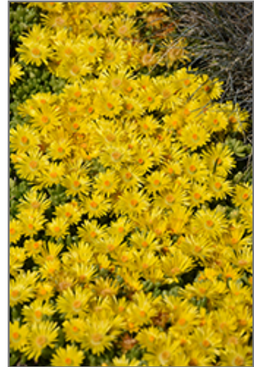
Yellow Ice Plant flowers

Yellow Ice Plant is recommended for the following landscape applications;