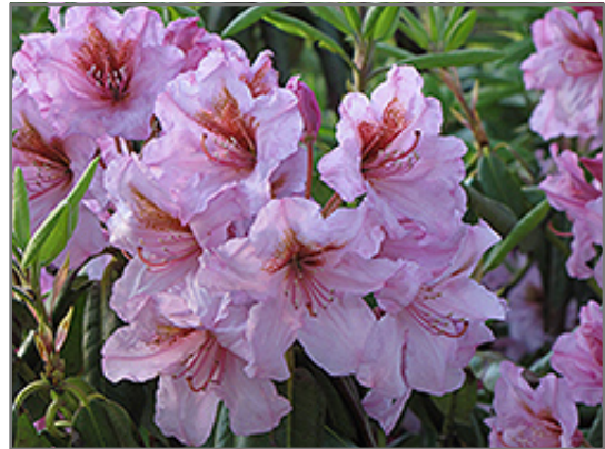
Kabarett Rhododendron flowers