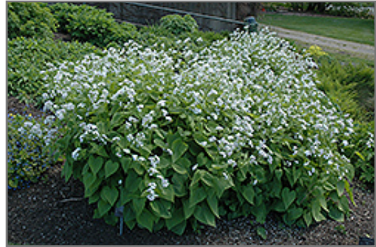
Perennial Money Plant in bloom

Perennial Money Plant is recommended for the following landscape applications;