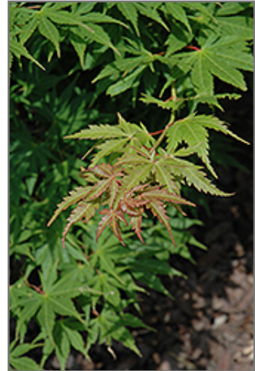
Yellow Bird Japanese Maple foliage