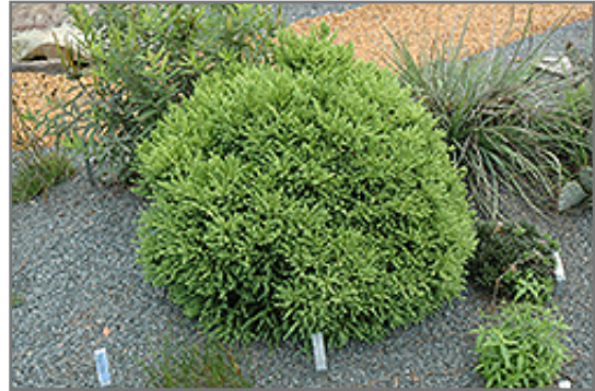
Little Diamond Japanese Cedar