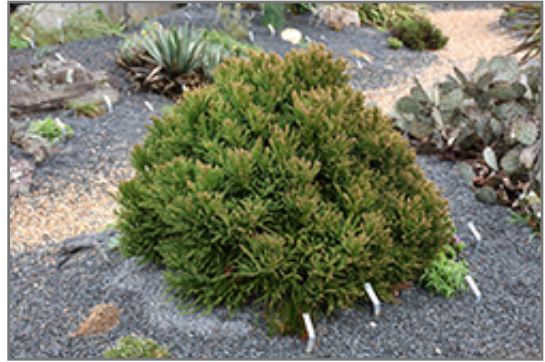
Little Diamond Japanese Cedar

This shrub does best in full sun to partial shade. It prefers to grow in average to moist conditions, and shouldn't be allowed to dry out. It is particular about its soil conditions, with a strong preference for rich, acidic soils, and is able to handle environmental salt. It is quite intolerant of urban pollution, therefore inner city or urban streetside plantings are best avoided, and will benefit from being planted in a relatively sheltered location. Consider applying a thick mulch around the root zone in winter to protect it in exposed locations or colder microclimates. This is a selected variety of a species not originally from North America.