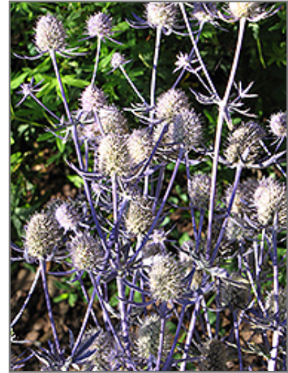
Jade Frost Variegated Sea Holly flowers

Jade Frost Variegated Sea Holly will grow to be about 8 inches tall at maturity extending to 24 inches tall with the flowers, with a spread of 15 inches. When grown in masses or used as a bedding plant, individual plants should be spaced approximately 12 inches apart. Its foliage tends to remain low and dense right to the ground. It grows at a medium rate, and under ideal conditions can be expected to live for approximately 10 years. As an herbaceous perennial, this plant will usually die back to the crown each winter, and will regrow from the base each spring. Be careful not to disturb the crown in late winter when it may not be readily seen!