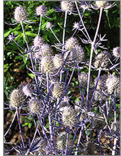
Jade Frost Variegated Sea Holly flowers

Jade Frost Variegated Sea Holly will grow to be about 8 inches tall at maturity extending to 24 inches tall with the flowers, with a spread of 15 inches. When grown in masses or used as a bedding plant, individual plants should be spaced approximately 12 inches apart. Its foliage tends to remain low and dense right to the ground. It grows at a medium rate, and under ideal conditions can be expected to live for approximately 10 years. As an herbaceous perennial, this plant will usually die back to the crown each winter, and will regrow from the base each spring. Be careful not to disturb the crown in late winter when it may not be readily seen!