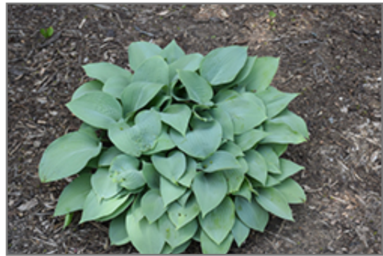
Carolina Blue Hosta