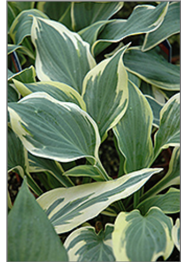
Chantilly Lace Hosta foliage

Chantilly Lace Hosta is recommended for the following landscape applications;