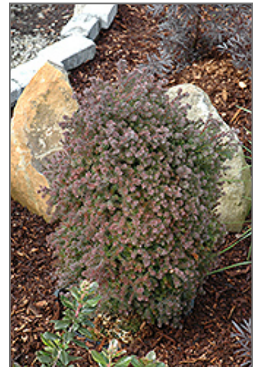
Red Star Whitecedar