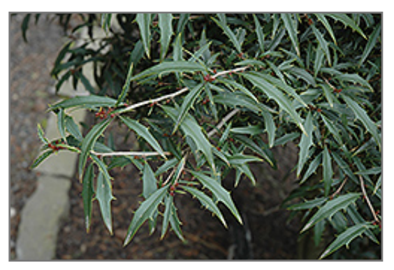
William Hawkins American Holly foliage