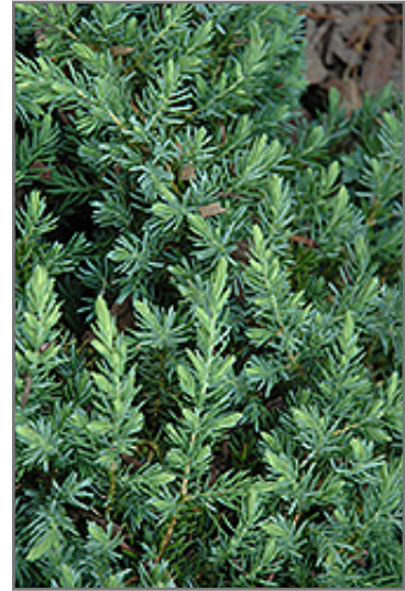
Blue Pacific Shore Juniper foliage