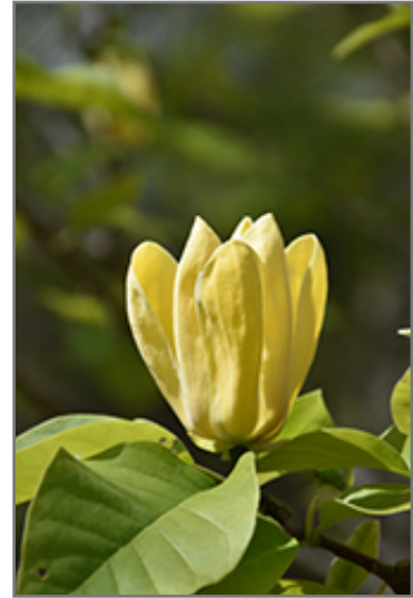
Yellow Bird Magnolia flowers