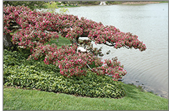
Candied Apple Flowering Crab in bloom