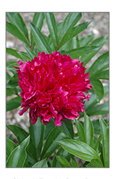
Gloire de Touraine Peony flowers

Gloire de Touraine Peony will grow to be about 30 inches tall at maturity, with a spread of 3 feet. When grown in masses or used as a bedding plant, individual plants should be spaced approximately 30 inches apart. The flower stalks can be weak and so it may require staking in exposed sites or excessively rich soils. It grows at a slow rate, and under ideal conditions can be expected to live for approximately 20 years. As an herbaceous perennial, this plant will usually die back to the crown each winter, and will regrow from the base each spring. Be careful not to disturb the crown in late winter when it may not be readily seen!