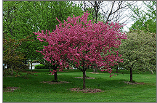
Prairifire Flowering Crab in bloom

This tree will require occasional maintenance and upkeep, and is best pruned in late winter once the threat of extreme cold has passed. It has no significant negative characteristics.