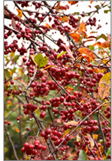
Prairifire Flowering Crab fruit

This tree should only be grown in full sunlight. It prefers to grow in average to moist conditions, and shouldn't be allowed to dry out. It is not particular as to soil type or pH. It is highly tolerant of urban pollution and will even thrive in inner city environments. This particular variety is an interspecific hybrid.