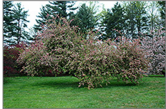
Bob White Flowering Crab in bloom