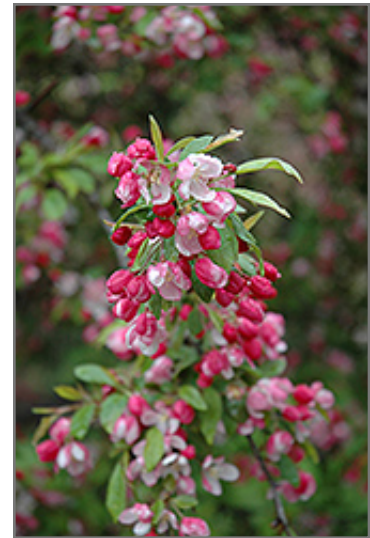
Bob White Flowering Crab flowers