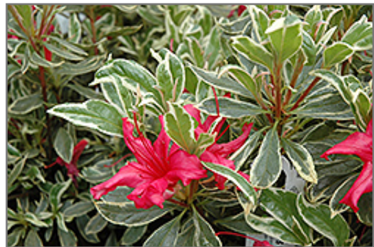
Girard's Variegated Gem Azalea flowers