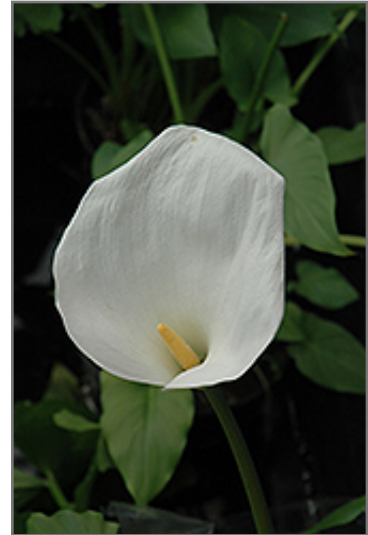
Calla Lily flowers