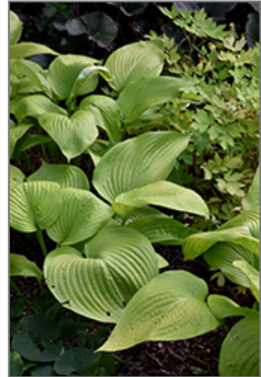
Key West Hosta

* This is a 'special order' plant - contact store for details