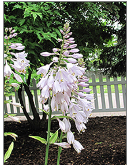
Key West Hosta flowers