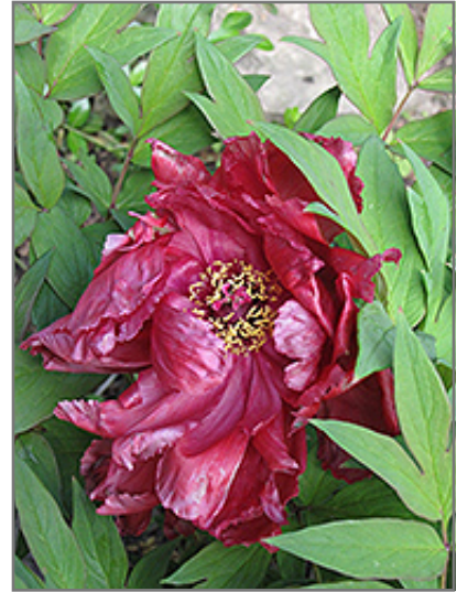
Koukamon Tree Peony flowers