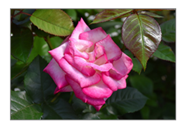
Melody Perfume Rose flowers